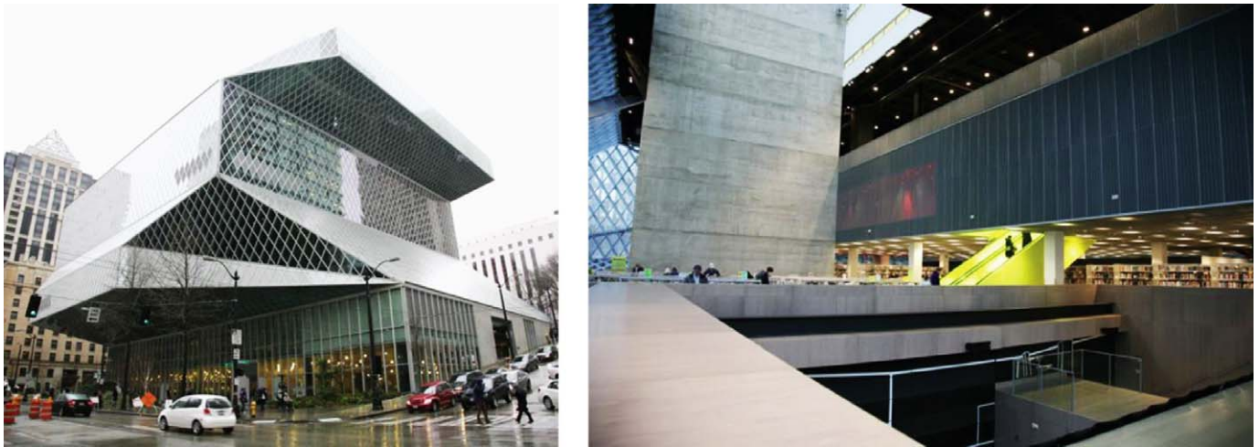
Fig. 1. Seattle Central Public Library exterior (a) and interior (b). Architect: Rem Koolhaas.

unique or might be confused; and (c) layout complexity, or the number of rooms and corridors and their configuration.