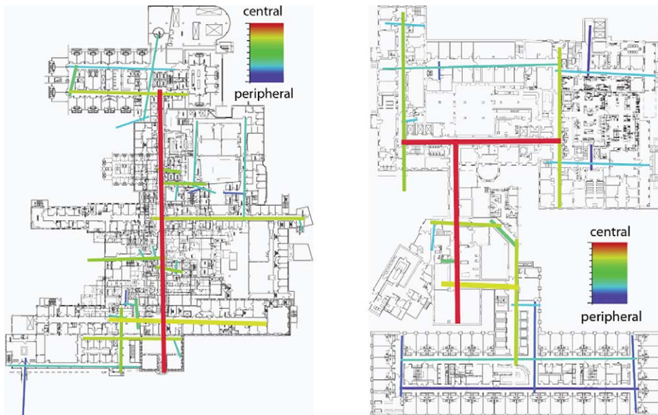
Fig. 2. Space syntax analysis of two hospitals located in a major U.S. city, studied and labeled “University Hospital” (left panel) and “City Hospital” (right panel) by Haq & Zimring (2003). Each line in each panel represents a mutually visible connection between units (rooms, corridors), with the color of the line representing how strategically important or central that unit is to the building as a whole. Warmer colors (anchored by red) indicate more central locations (the lines are also thicker), and cooler colors (anchored by blue) indicate more peripheral locations (the lines are also thinner). The resulting network can be summarized using an intelligibility index that is the correlation between the number of direct visual connections from each room or corridor in the network and the strategic importance of that room or corridor. A high intelligibility score indicates that topologically central locations are associated with more possible paths and connections. High intelligibility may be expected to facilitate navigation, because most paths lead to or across the central locations. Low intelligibility indicates that central locations only have restricted paths, making navigation difficult because users must find the limited number of correct paths. University Hospital has a high intelligibility score of .831; City Hospital has a lower intelligibility score of .557.

not know whether that corresponds to the front of the building (see also Montello & Pick, 1993).