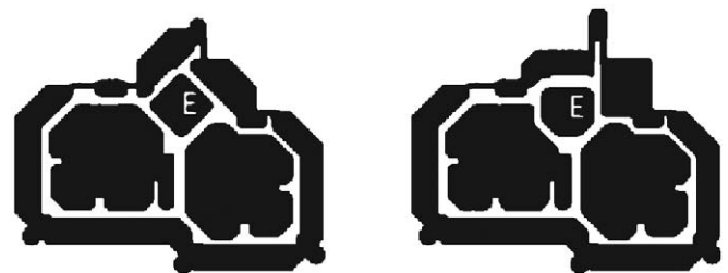
Fig. 3. A virtual environment constructed with two rooms and a central elevator, based on the town hall of Gottingen, Germany. Within the virtual environment, experimenters manipulated the orientation of the elevator (designated with an E) relative to two surrounding rooms, with different participants experiencing each orientation. The left panel shows the axes of the elevator misaligned from the axes of the rooms; the right panel shows the axes of the elevator and room aligned. (From Werner & Schindler, 2004.)

Some people are more prone to getting lost in a building than are others. Successful way-finding requires effective strategies, and each strategy is subserved by particular spatial representations and reasoning processes. Two strategies are commonly discussed: a route-based strategy in which a user tracks his or her movement through a building in a viewpoint-specific manner, and a survey-based strategy in which the user constructs a viewpoint-independent representation of the spatial relations that enables reasoning about relative orientation and distance. Way-finding is likely a combination of the two strategies (Ishikawa & Montello, 2006), with some individuals in some settings focusing on one or the other (Lawton, 1996). For a given strategy to be effective, an individual must meet the representational and processing demands of that strategy. For example, consider the example of learning a route through a low-intelligibility building like the one analyzed by Haq and Zimring (2003; e.g., Fig. 2, right panel) that requires many turns to get from one place to another. With each successive turn, it becomes increasingly difficult to maintain one’s sense of direction. Different people will have different thresholds